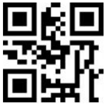
USB PC Keyboard

If there is no new keyboard device recognized after connecting to the computer, scan the USB PC output setting code, and then test again. If there is still no device recognized, it is recommended to replace the USB cable.