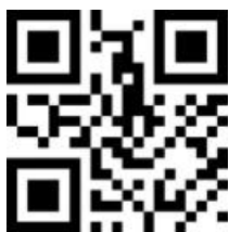
Serial Port Output

The module supports serial port output, when using serial output, you need to scan the setting code first to change the output mode to serial port output. The default serial parameters are 9600, 8N1, and the baud rate can be modified (please refer to the user manual).